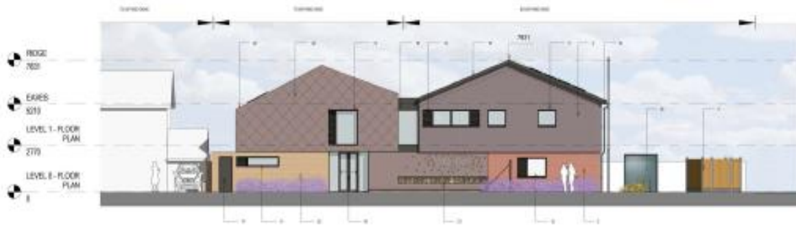
A WEST ELEVATION 1:50