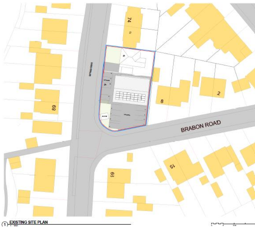
Existing site plan