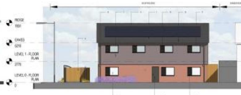
D SOUTH ELEVATION 1:50