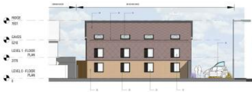
C NORTH ELEVATION 1:50