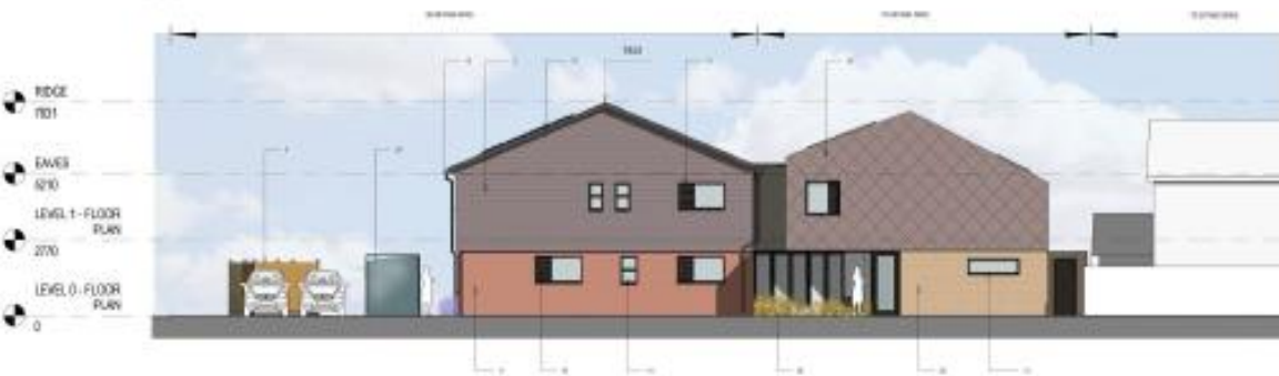
B EAST ELEVATION 1:50